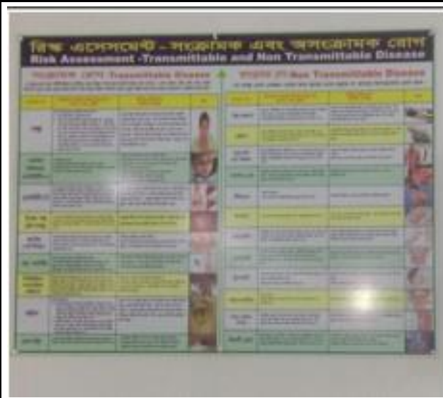
Posted Risk Assessment