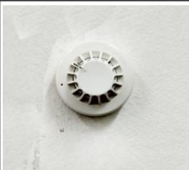
Smoke And Hit Detector