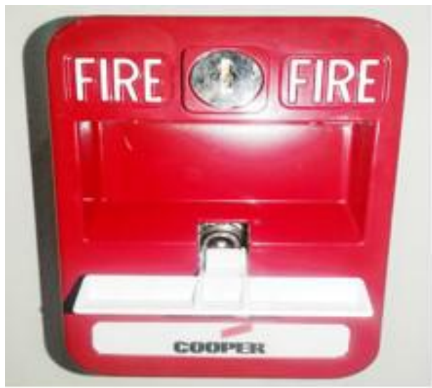
Fire Alarm Switch