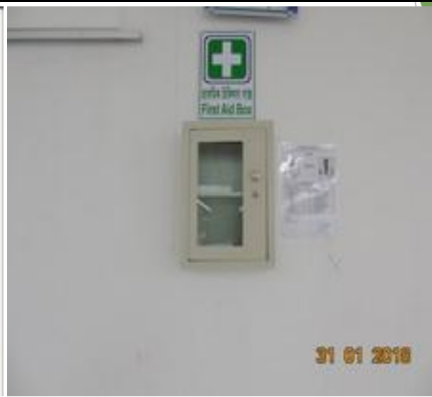
First Aid Box