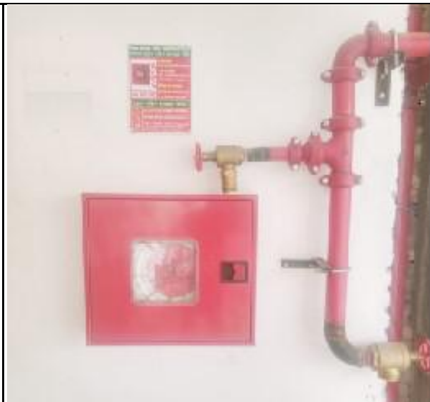
Fire Hydrant Point